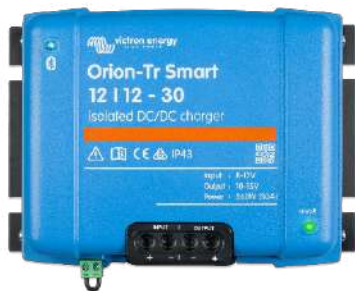
Orion-Tr Smart 12/12-30