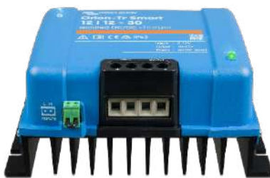
Orion-Tr Smart 12/12-30