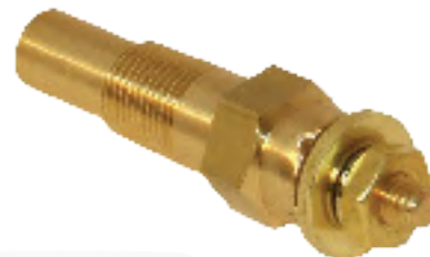
FAR90406 American resistance standard earth dual station

A European resistance fuel sender will have an output of around 10 Ohms on empty and as the fuel level increases so will the Ohms, while an American resistance fuel sender will have an output of around 240 Ohms and the resistance will decrease as the fuel level increases. This is why you must match the resistance of the gauge and sender as the most common problem we hear is when this has not been done correctly, so the gauge will be reading opposite to what it should be.