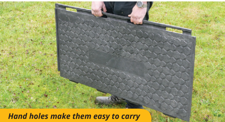
Hand holes make them easy to carry