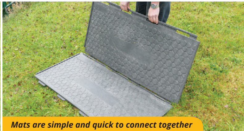
Mats are simple and quick to connect together