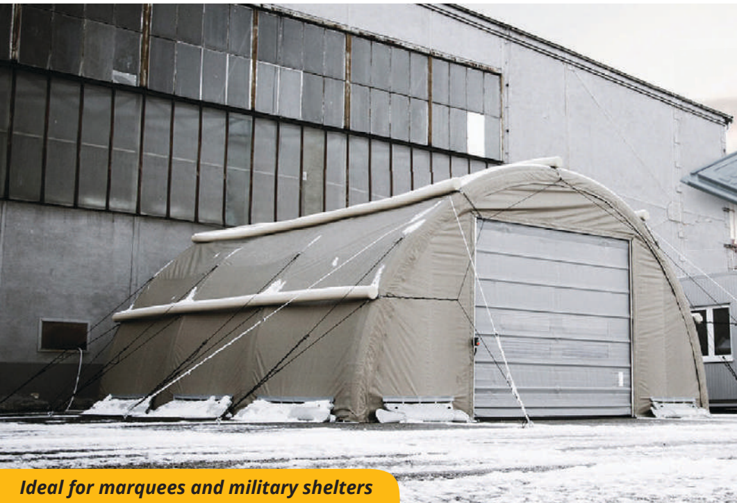
Ideal for marquees and military shelters