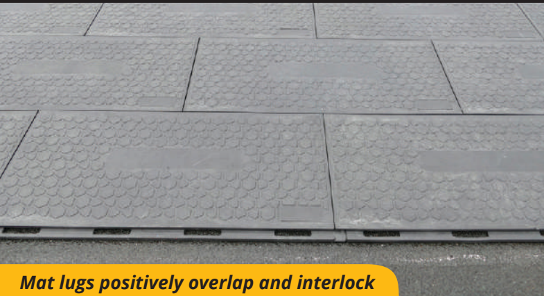
Mat lugs positively overlap and interlock